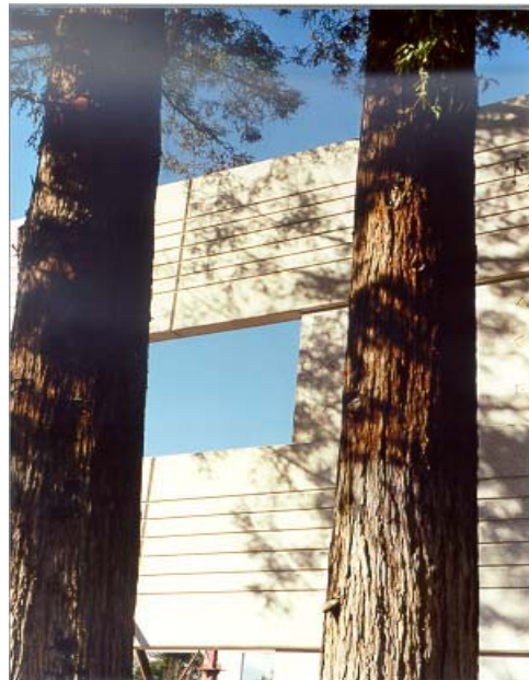
White concrete using Lehigh White Cement