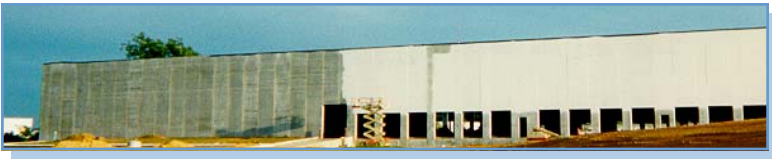
Gray concrete painted white

With the ever increasing use of tilt-up construction, builders and building owners now have another choice for exterior surfaces.