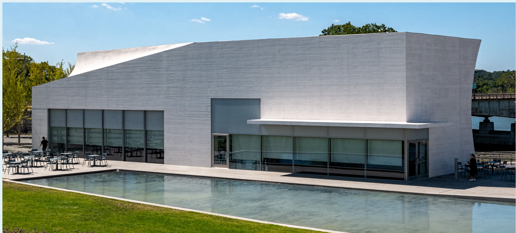
River Pavilion

Seen from a distance the walls of The REACH's pavilions appear smooth, rising transcendent above the Kennedy Center's south lawn. Up close where they are designed to be experienced, visitors appreciate the touch of natural wood grain from authentic Douglas fir form linings which provide texture and transform the structures surface.