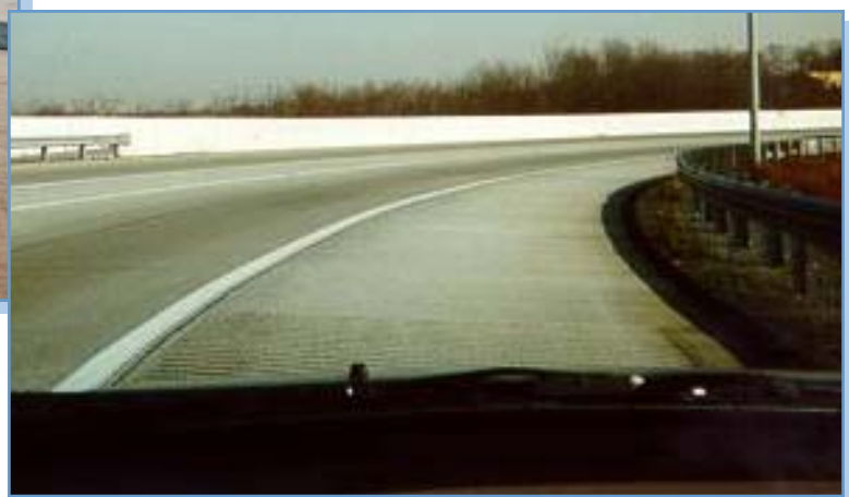
White concrete barrier—