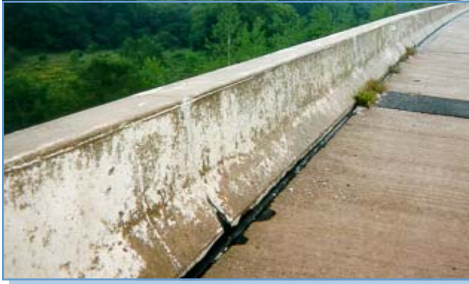
Gray concrete barrier painted white — In need of re-painting.