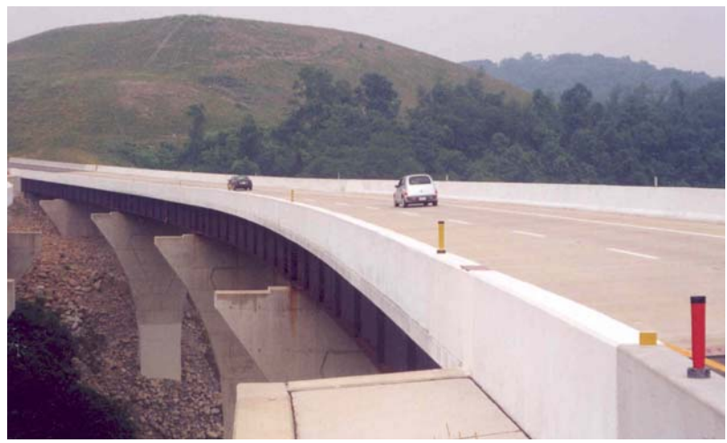
Mon Fayette Highway, Pennsylvania