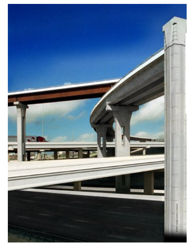
I-35 Austin, Texas