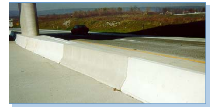
PA-581, Capital Beltway, Harrisburg, Pennsylvania