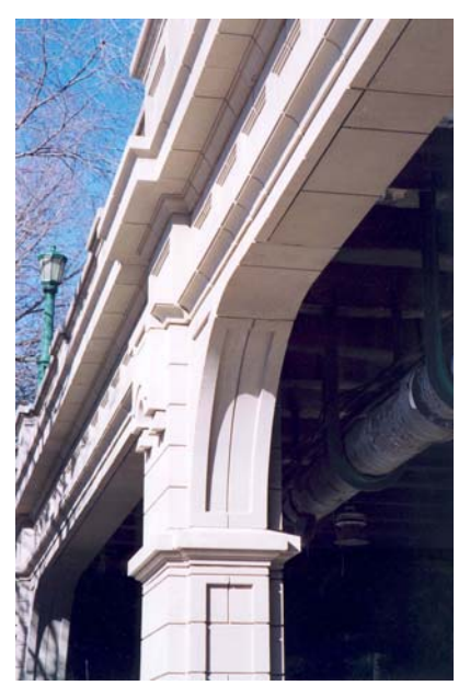
Sheridan Street Bridge, Evanston, IL