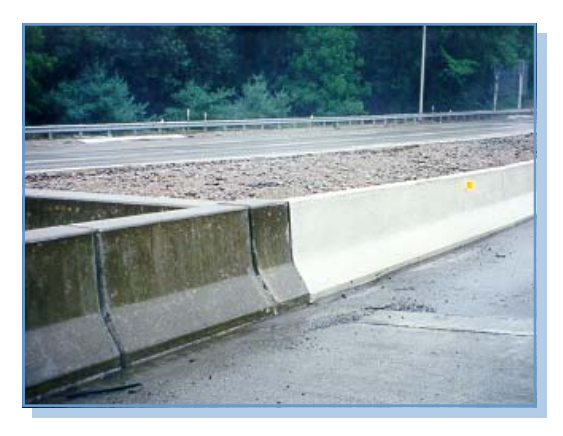
I-287 New Jersey