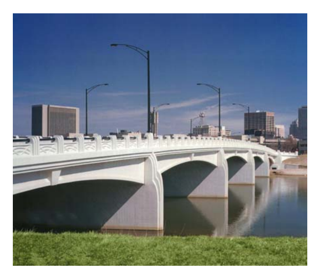
Fifth Street Bridge, Dayton, OH