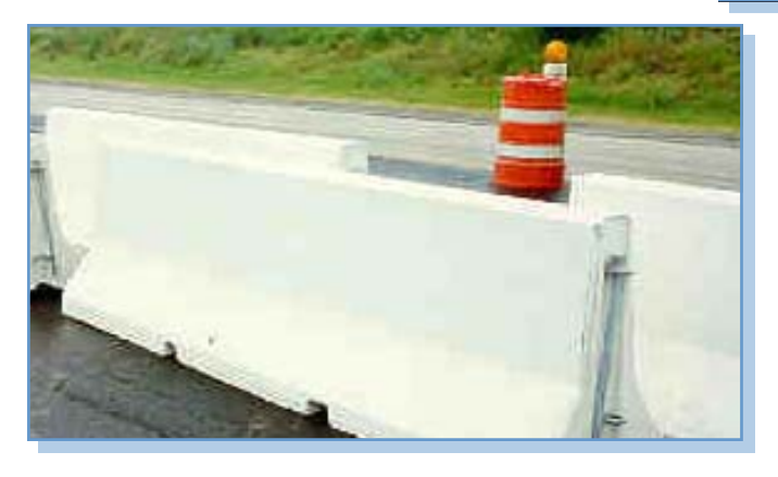
White concrete barriers for construction work zones.