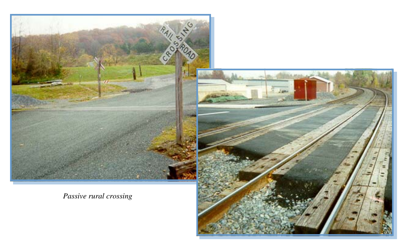
Asphalt with timbers

"Each year, hundreds of fatalities are sustained at the nation's ubiquitous highway-rail grade crossings. Many are the result of drivers deliberately circumventing or otherwise purposely violating active control devices. In other cases drivers are unsure of their responsibilities because warning devices, both active and passive, are perceived by motorists as ambiguous." (from AASHTO Strategic Highway Safety Plan approved by Board of Directors, December 1997.)