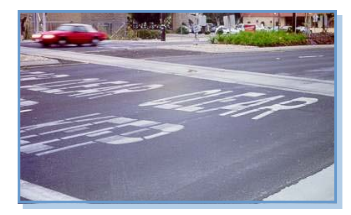
Cal Trans Crossing San Jose, CA