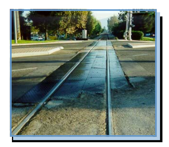
Metal crossing, Petaluma, California

The Borough Manager said this crossing needs frequent repairs because the blacktop base surrounding the tracks is not solid. The borough would like to eventually have a concrete base. "The biggest concern is that when the work is done, it will last a lot longer than it did the last time."