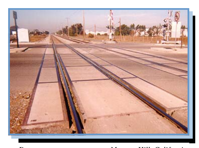
Dry precast, gray concrete. Morgan Hill, California