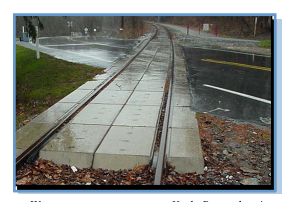
Wet precast, gray concrete. York, Pennsylvania