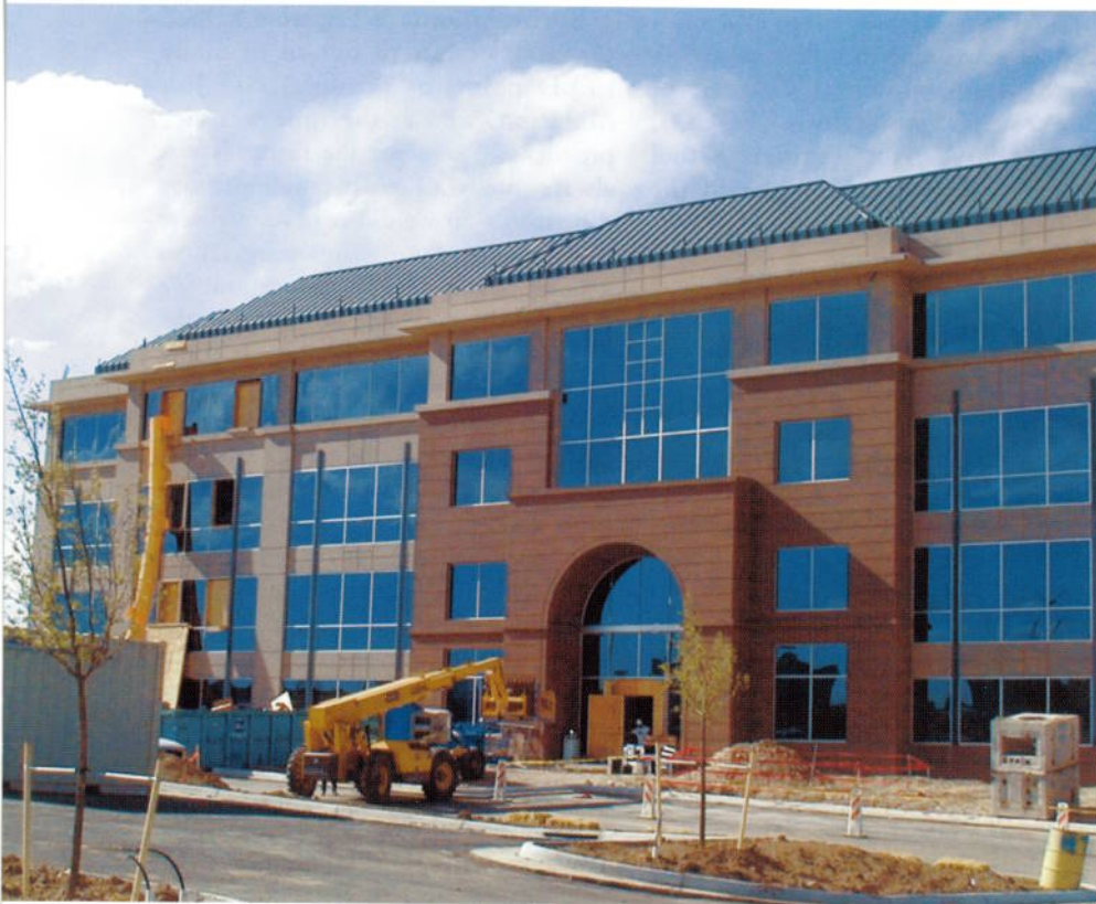
The buildings are designed to provide a corporate identity — and to be marketable in case CH2M Hill ever moves or downsizes.

building, but the precast components could be completed so quickly that the client moved into the third structure just one month after occupancy of the other two buildings.