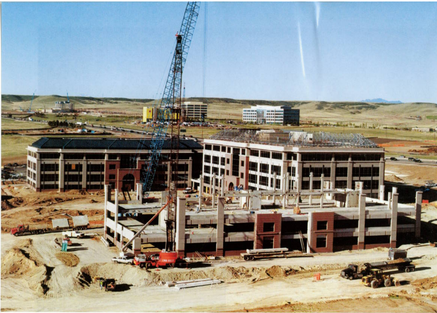
All three buildings feature total-precast structural systems. The third building, in the foreground, is a support structure that houses the data center. It was designed, fabricated and erected in just 11 months. Rocky Mountain Prestress was both the precaster and the erector.