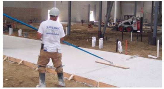
WinCo Foods Supermarkets Placement by: Meidling Concrete Inc.

Lehigh White Cement Company 7660 Imperial Way, Allentown, PA 18195 e-mail: info@lehighwhitecement.com www.lehighwhitecement.com