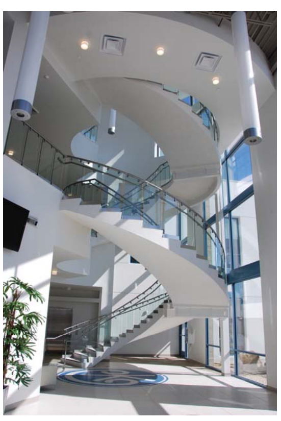
PKG CAMPUS Designer: Johnson Architects Manufacturer: Northwest Precast

Since 1897, the name Lehigh has meant quality in the cement and concrete industries. Lehigh White Cement Company is the foremost supplier of white cements in North America, and has a well established reputation for high-performance products that encourage creativity and ensure longevity.